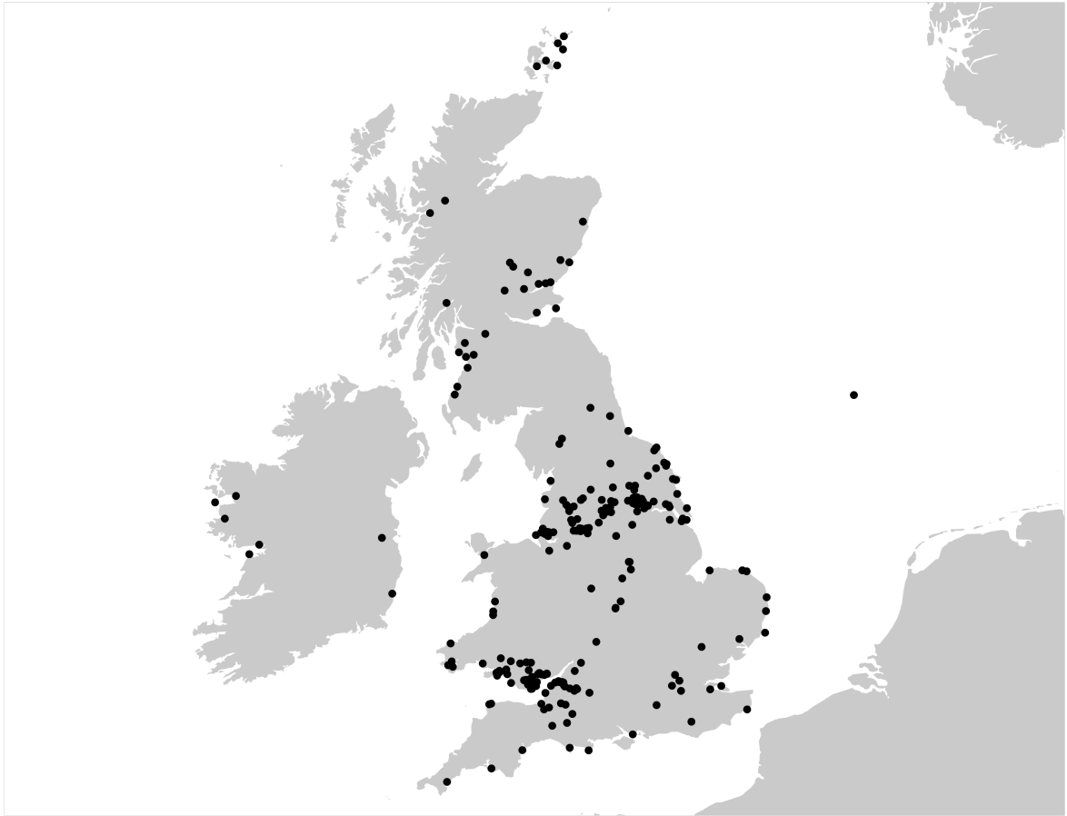
Figure 1. Geographical distribution of phantom airship sightings, October 1912-April 1913.