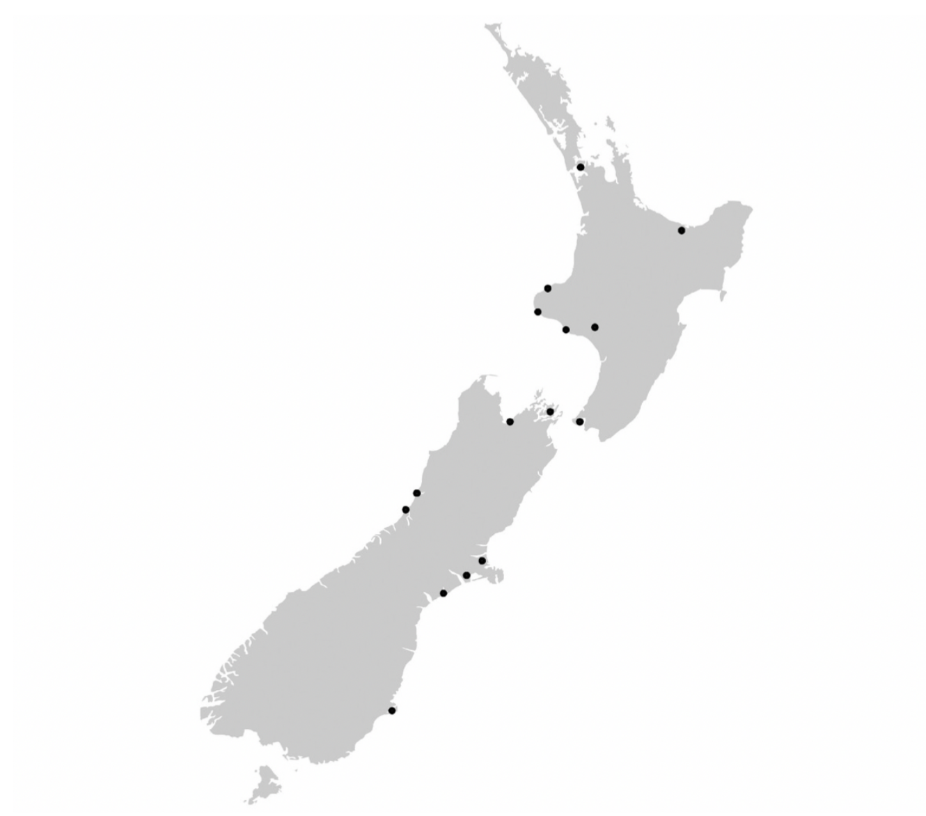
Figure 5.1: Location of mystery aeroplane sightings in New Zealand, 1918.

The mystery aeroplane scare of 1918 was far greater in intensity and extent than these earlier episodes, however, involving over two hundred sightings in Australia and New Zealand over a period of months. Although the scare began in New Zealand, the great majority of reports came from Australia. But the evidence from each country differs qualitatively as well as quantitatively, with the official archival record dominating in Australia and vaguer, often cryptic press accounts dominating in New Zealand, which constrains what can be known about either case.