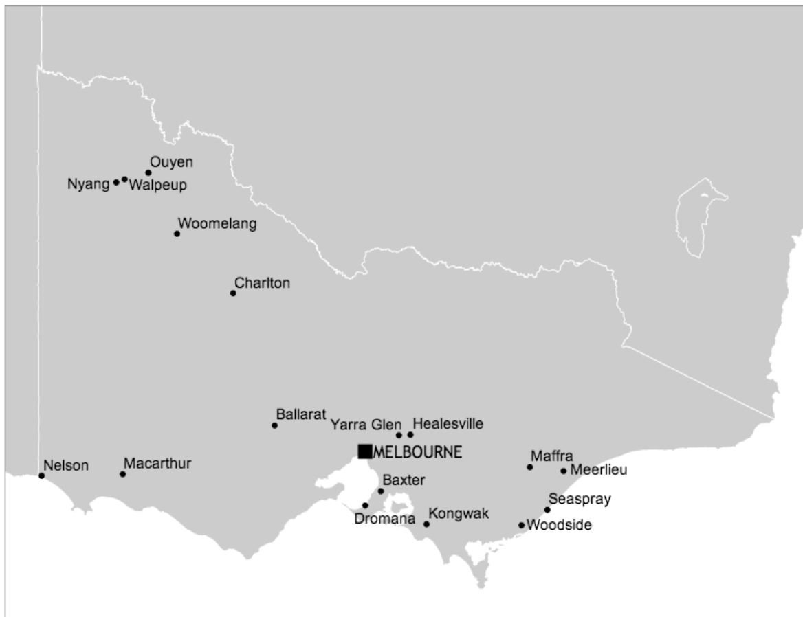
Figure 1. Locations of mystery aeroplane sightings in southeastern Australia mentioned in the text.

however, as it provides us with an opportunity to peer into the fears of war-weary Australians in the final months of a war which still seemed very far from being won. It was the product of years of fantasising about a German enemy within who were supposedly undermining Australia's war effort; the sudden belief in the spring of 1918 that the war might be lost, thanks to the apparent change of fortunes on the Western Front; and a new appreciation of the new possibilities of aerial warfare, drawn from news from the war overseas and the spurious claim that a seaplane from the German merchant raider SMS Wolf had flown over Sydney in 1917.