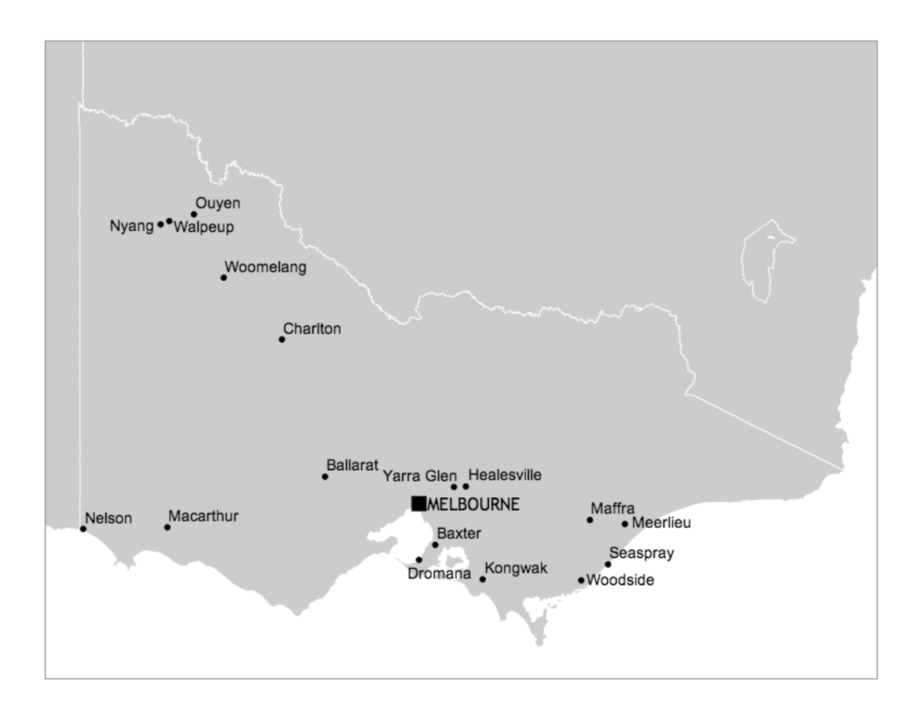
Figure 1. Locations of mystery aeroplane sightings in southeastern Australia mentioned in the text.

however, as it provides us with an opportunity to peer into the fears of war-weary Australians in the final months of a war which still seemed very far from being won. It was the product of years of fantasising about a German enemy within who were supposedly undermining Australia's war effort; the sudden belief in the spring of 1918 that the war might be lost, thanks to the apparent change of fortunes on the Western Front; and a new appreciation of the new possibilities of aerial warfare, drawn from news from the war overseas and the spurious claim that a seaplane from the German merchant raider SMS Wolf had flown over Sydney in 1917.